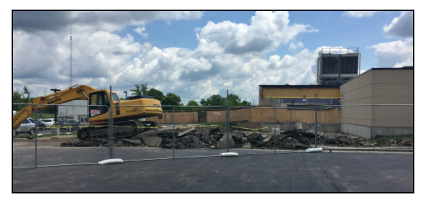
The $2.3 million expansion will provide 7,000 additional squarefeet within Medical Imaging and shell space for future Emergency Department expansion.