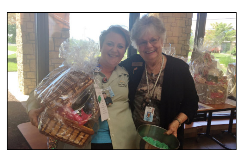
Seventeen Celebration Baskets, a chaise lounge and a trip to Rocheport, Mo., were raffled on Friday, May 13.