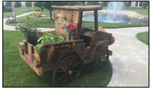
During the sale, a handcrafted wooden truck planter constructed by the Old Order Mennonites of Tipton, Mo., will be available for raffle at $5 per ticket.

Join us to shop for perennials, mums and other fall color favorites. Proceeds from the sale will benefit the Cass Regional Gardens.