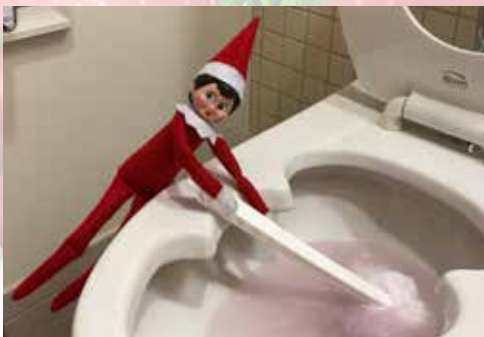
Candycane helps EVS keep patient rooms clean during the holiday season.