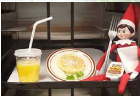
Candycane enjoying a pancake in Dietary!