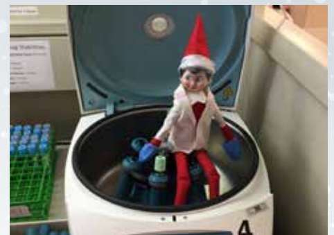
This looked fun to Candycane who just had to take a little spin for herself in the Laboratory.