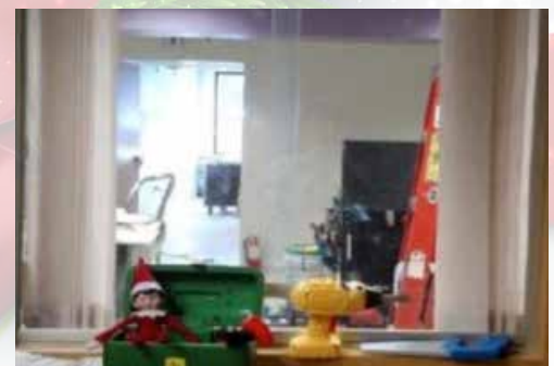
Candycane got lost and went to the wrong department! Pediatrics is under construction. Come visit us in Observation.