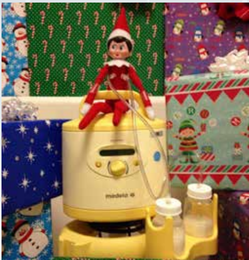
"The gift of a Mother Elf's milk." OB Department

Purpose, Worthwhile Work, Making a Difference!