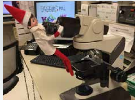
Candycane was amazed by the amount of work technicians do behind the scenes in the Laboratory.