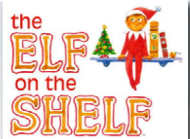
Thank you to all the CGHers who participated in our 2016 CGH Elf-Capades! We received more submissions than we were able to post on Facebook, so we've included some here for your viewing pleasure. (Look for more pictures on the next page.)