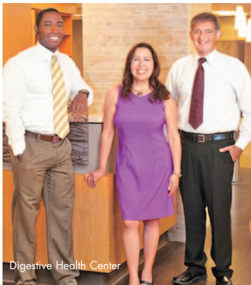
Digestive Health Center

This commitment to our patients and families extends beyond the hospital doors.