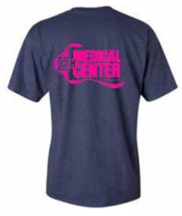
September 15 7 am to 1pm near CGH Classrooms 1 & 2

September 11 11 am to 1pm near the CGH Cafeteria