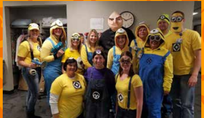
CGH Locust Street Rehab