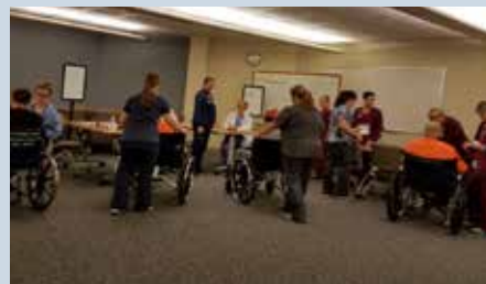
Minimum Treatment Area

We tested the Hospital Command Center, a new Triage area, expanded Minimum Treatment Area, Labor Pool, and many other aspects of the Emergency Management plan. It is through these continued exercises that we are able to evaluate our processes and make improvements, and also let staff become more comfortable in dealing with emergency events.