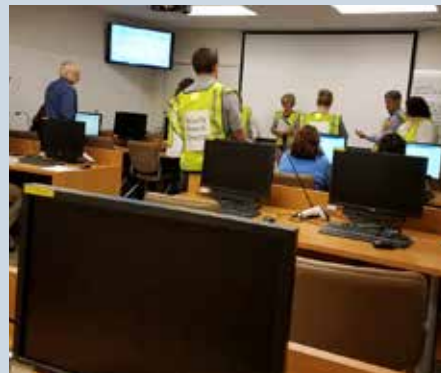
Hospital Command Center

A big THANK YOU to everyone who participated in the Emergency Management exercise with Monsanto on June 28th.