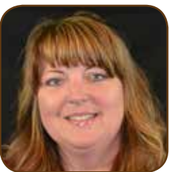
Laura Stoudt Digestive Health Center