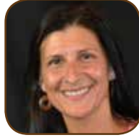
Amber Guinn Critical Care Unit