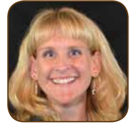
Kerensa Pink Dietary