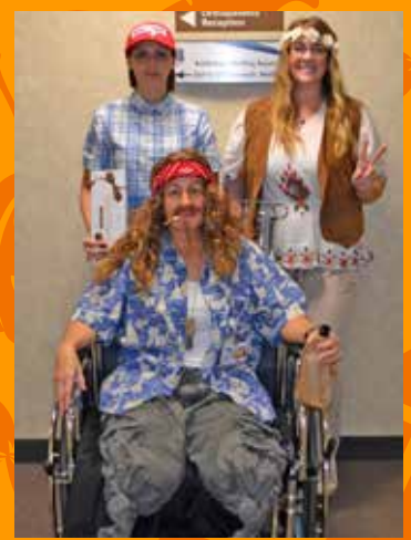
Main Clinic Radiology -Forrest Gump