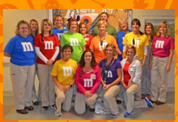
Hospital Diagnostic Imaging