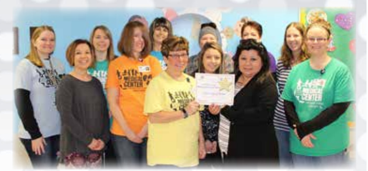
Congratulations to CGH Helping Hands Daycare for receiving Honorable Mention for "Favorite Children's Daycare" in Sauk Valley Media's 2019 Reader's Choice Awards!