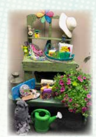
#101 Garden Delights Donated by Lab

If you are a winner, please pick up your basket tomorrow at 3:45 p.m. or on Monday from 9 to 10 a.m. in Classroom 2.