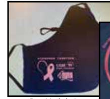
Face Mask design