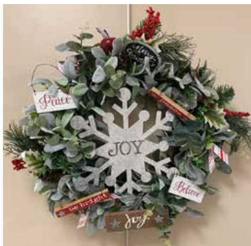
Peace and Joy