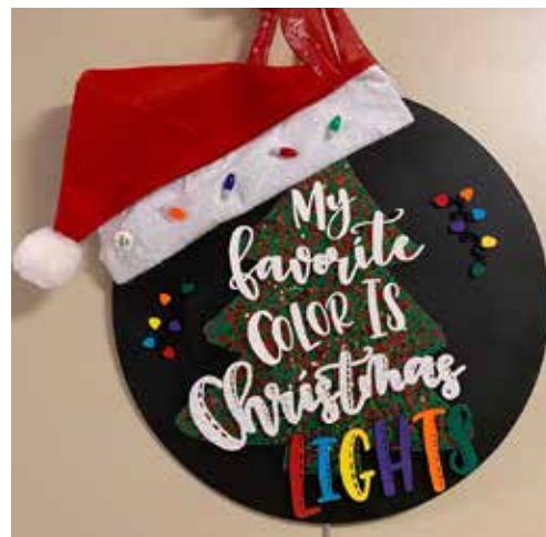
My Favorite Color is Christmas Lights