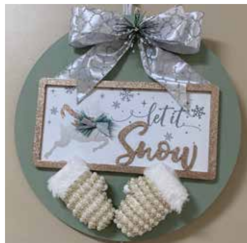
Let it Snow