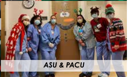
ASU & PACU