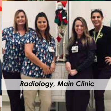
Radiology, Main Clinic