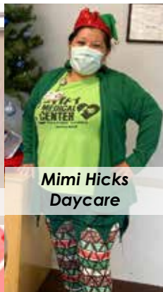
Mimi Hicks Daycare