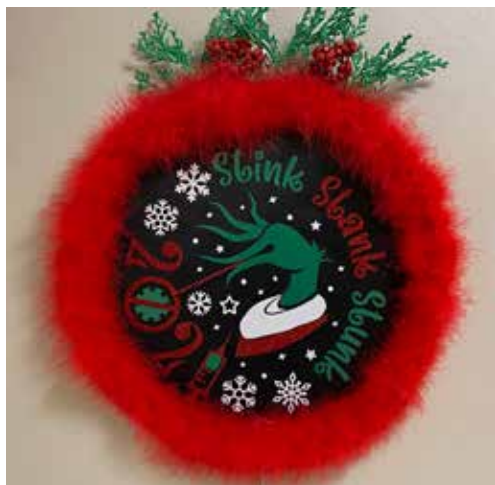
2021: Stink, Stank, Stunk