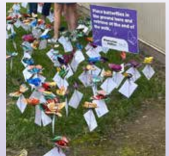
A butterfly garden was created at the Memories Matter Walk in memory and in honor of those impacted by dementia.