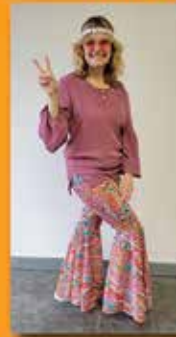
SALLY DOUGLAS ENVIRONMENTAL SERVICES

CONGRATULATIONS TO OUR FACEBOOK "PEOPLE'S CHOICE" AWARD WINNERS!