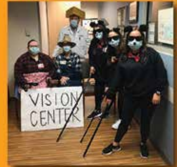
THE VISION CENTER - STERLING THREE BLIND MICE, FARMER, FARMER'S WIFE, AND CHEESE

We had a tremendous response by the public, with lots of comments and reactions in support of ALL of your creative costumes! THANK YOU TO EVERYONE WHO PARTICIPATED!