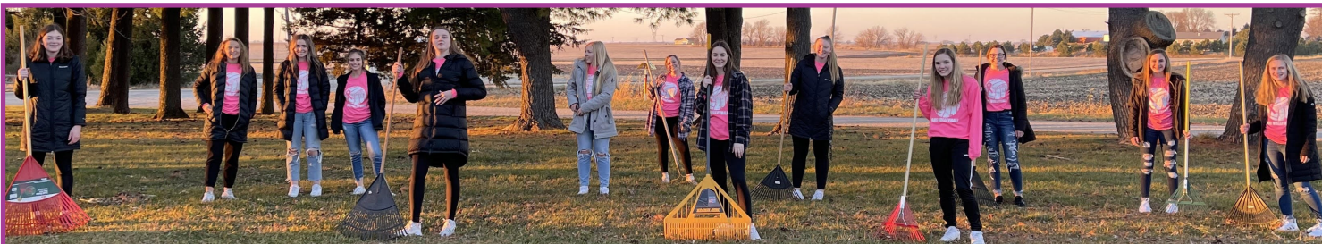
AHS Volleyball team members, shown above, during one of their afternoons working in a yard.

In honor of Breast Cancer Awareness month, the AHS Volleyball teams volunteered to rake and pick up sticks in area yards during the fall for donations to the CGH Health Foundation. Together, the girls raised $705 by doing this yard work!