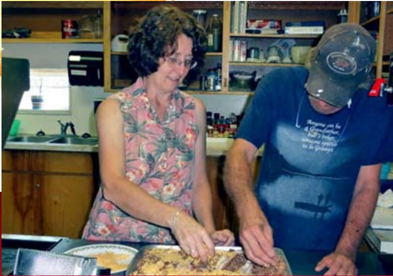
Stepping Stone volunteer working with 3rd Street Station resident on meal preparation