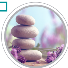
Therapeutic Health Services

Massage, facials, sunless tanning, waxing, Reflexology, paraffin hand dips, herbology body treatments.