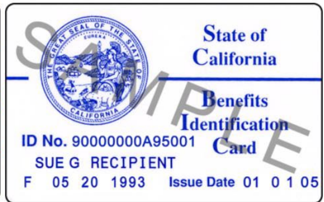
"Blue and White" design