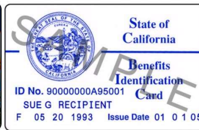
"Blue and White" design