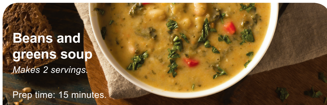
Beans and greens soup

Crusty, whole-grain rolls and fresh fruit salad pair especially well with this hearty soup.