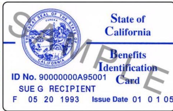
"Blue and White" design