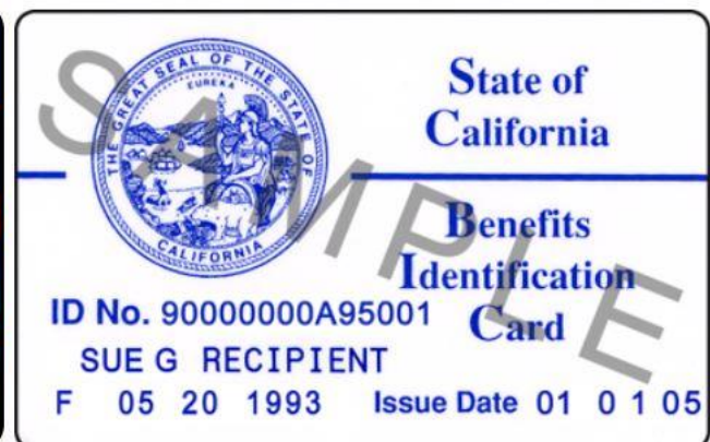
"Blue and White" design