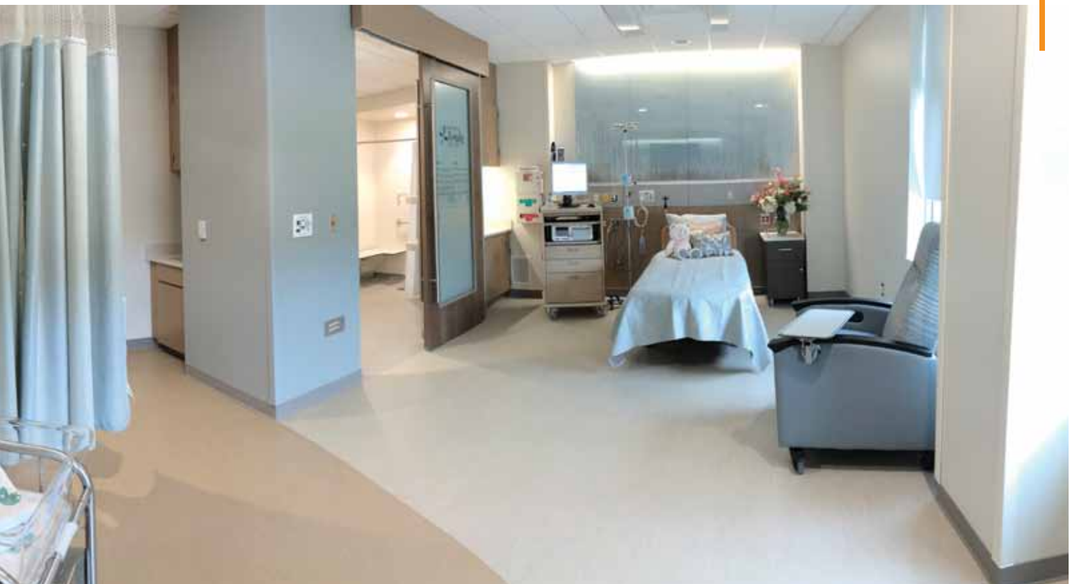
Lake Regional Family Birth Center suite

pediatric patients needing overnight care, meeting a longstanding need for the lake area. Learn more at www.lakeregional.com/womenandchildren .