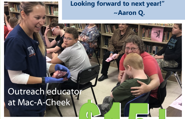
Outreach educator at Mac-A-Cheek