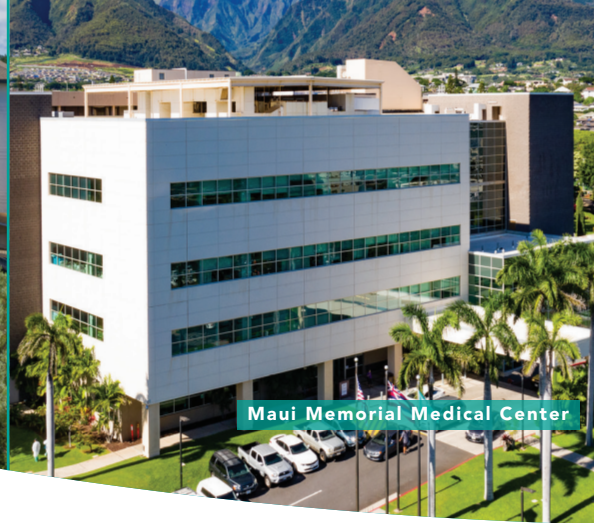
Maui Memorial Medical Center