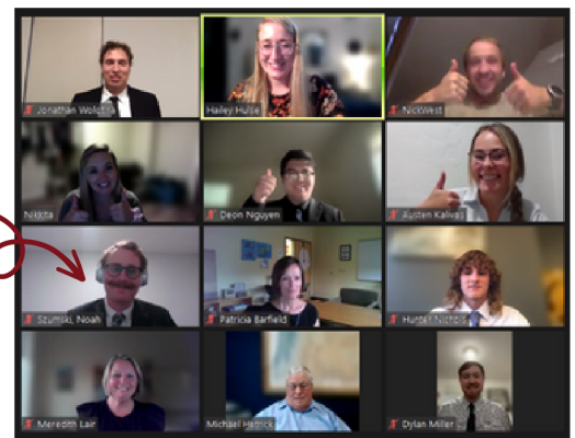
Mock interviews with Pre-Health Society members & NEOAHEC Staff and Board

"NEOAHEC has been instrumental in preparing me for the medical school application process. NEOAHEC has provided access to tools and support such as Mappd, to organize experiences and activities prior to filling out the application, and to assist in preparation for the MCAT. They have also provided resources to improve my personal statement and other aspects of my application. Most of all NEOAHEC has been a wealth of information and opportunity. I have learned more about medical schools, particularly in the pacific northwest, and have had the opportunity to hear directly from schools about what they value in a student.