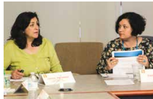
Consumer Advisory Committee members presenting at a meeting

Consumers and advocates on the Consumer Advisory Committee (CAC) assist SCFHP in establishing and maintaining culturally and linguistically appropriate linkages to the community. The CAC is made up of SCFHP members or their parents, community advocates, and healthcare providers.