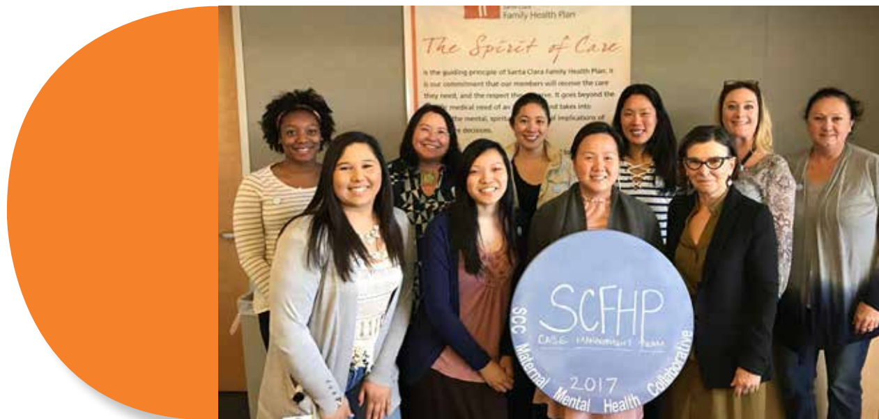
SCFHP Case Management Team