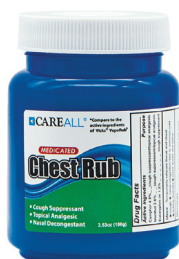
Vapor Rub, 3.5 oz. Count: 1