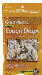
Cough Drops, Honey Lemon Count: 30