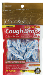
Cough Drops, Sugar-Free Count: 25