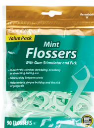
Interdental Flossers Count: 90