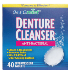
Denture Cleaning Tablets Count: 40