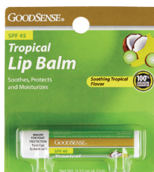
Medicated Lip Balm, 0.15 oz. Count: 1