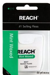
Dental Floss, Reach® Mint Waxed Count: 1