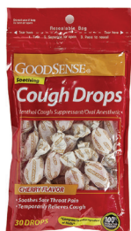
Cough Drops, Cherry Count: 30