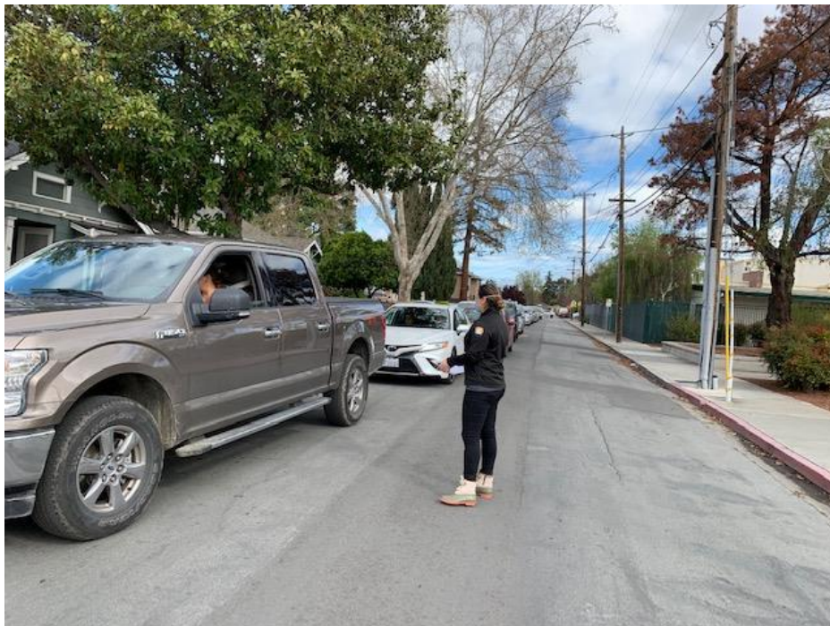
Photo of Families Lined up to Receive Diapers, Baby Wipes, and Food at Luther Burbank FRC