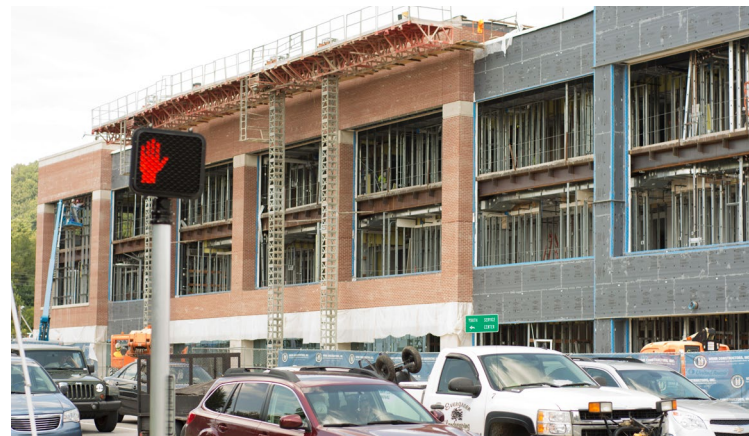
PROGRESS AS OF AUG. 31, 2017