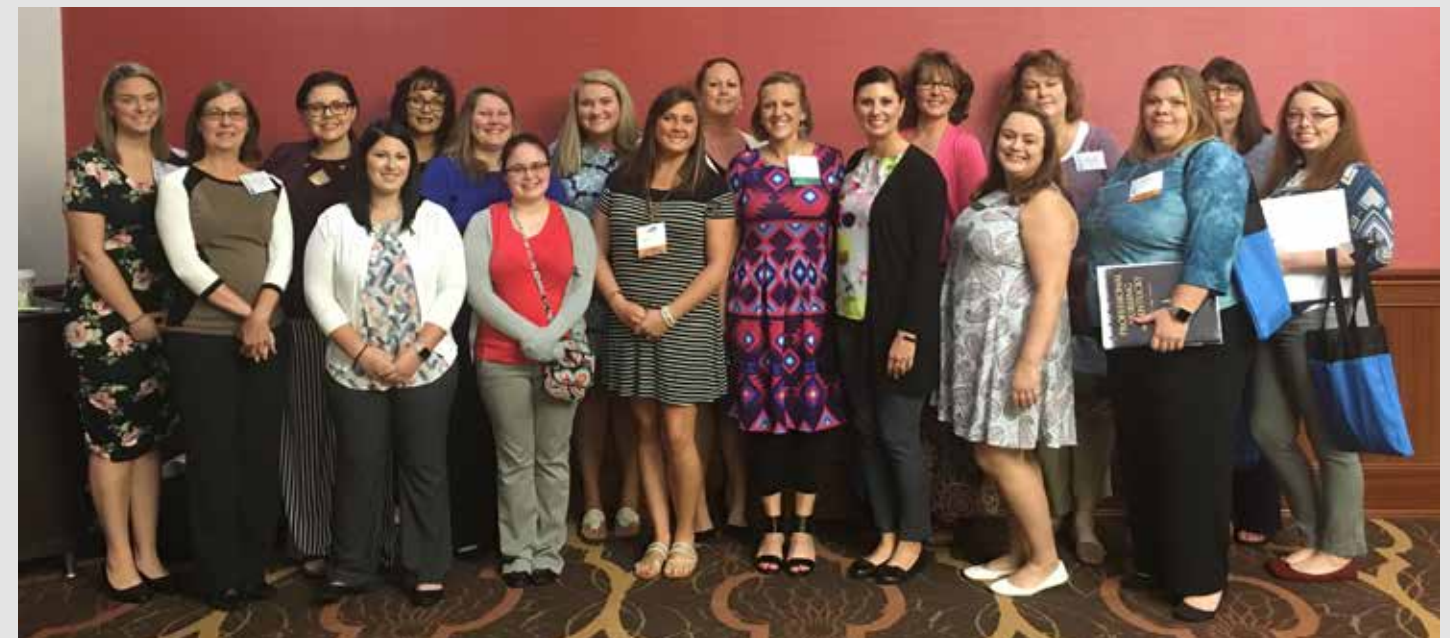
Nurse leaders from St. Claire HealthCare recently attended the 13th Annual KONL Leadership Development Conference - Navigating Climate Change: Future of Healthcare and Nursing in an Ever-Changing Environment. The conference was focused on ongoing changes in healthcare policies and trends, to prepare Kentucky Nurse Leaders with the skills and tools to lead effectively.