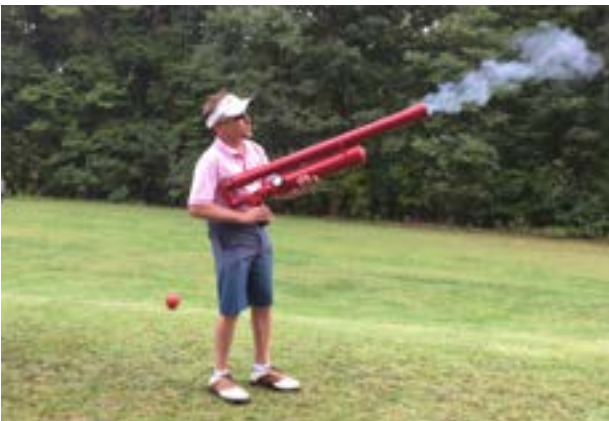
"Teeing off" on the ball launcher hole, is a St. Claire Foundation golf outing fan favorite.

Over the course of the past 23 years, the golf outing has raised more than $1.6 million in cash and product contributions to support our charity care efforts. Last year, St. Claire provided more than $3.5 million in charity and uncompensated care, at cost.