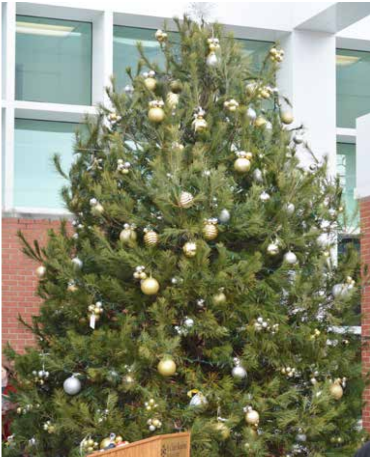
The nearly 20-foot tree was purchased by the SCH Auxiliary from Hutton-Loyd Tree Farm, and was installed and decorated by SCH's facility management team.