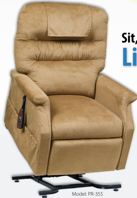
Model: PR-355 Color: Medium Autumn

Sit, Recline, Lift or Stand all with the touch of a button Lift Chairs starting at $499