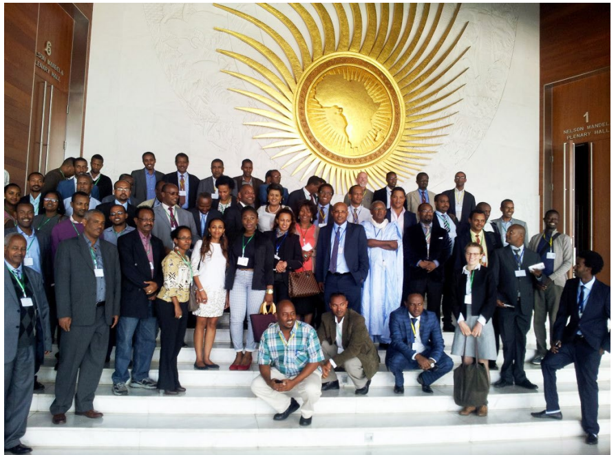
P2P organizes and hosts a variety of conferences to generate ideas to improve education and healthcare across the world. Pictured are attendees at the PanAfrica Health Care and Medical Education Conference held at the Africa Union Hall in Addis Ababa, Ethiopia.