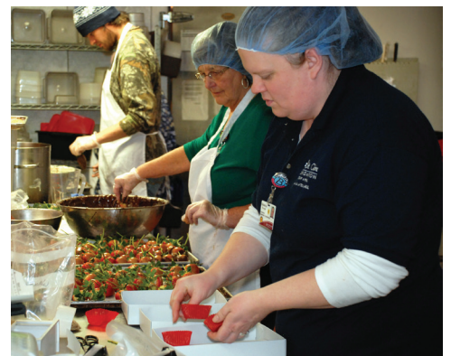
Food services staff working hard to complete the final orders for Valentine's Day