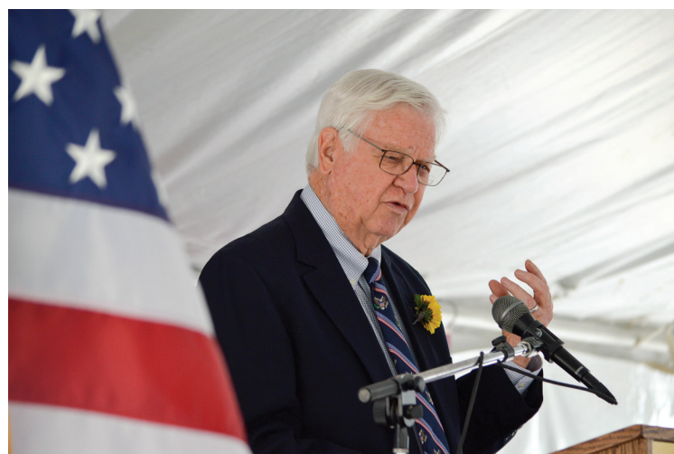
U.S. Congressman Hal Rogers spoke of his excitement for the new Medical Pavilion, praising SCR for being one of the top employers locally, and for increasing healthcare access in the region.