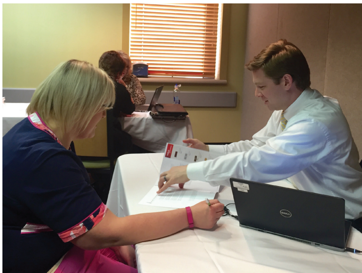
SCR Staff meeting with Transamerica Retirement representatives during SCR's 401k Day event.