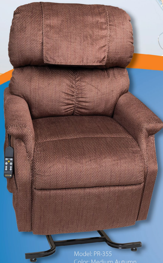
Model: PR-355 Color: Medium Autumn

Sit, Recline, Lift or Stand all with the touch of a button Lift Chairs starting at $499