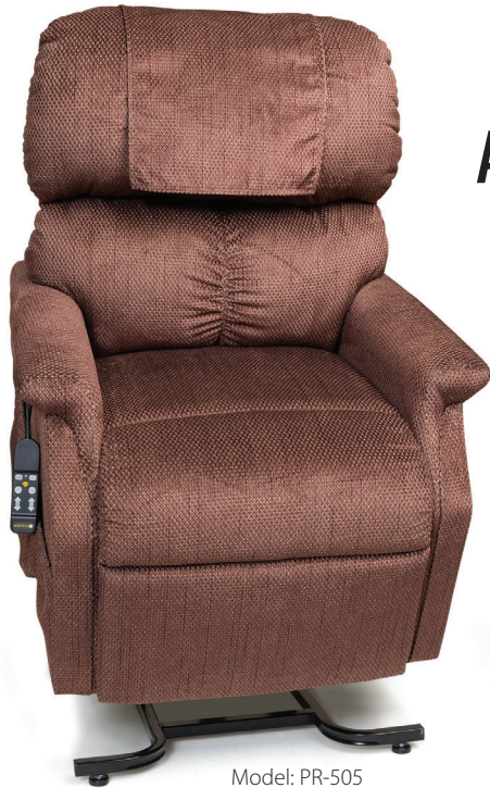
Model: PR-505 Color: Palomino

Select Items Throughout the Store February 9 - March 9