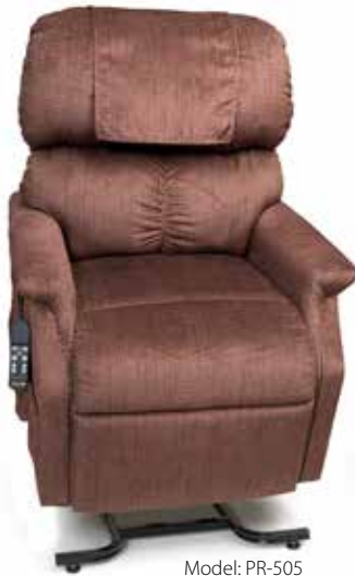
Model: PR-505 Color: Palomino