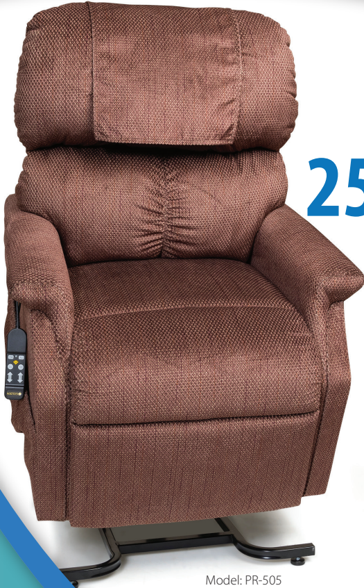
Model: PR-505 Color: Palomino Not valid with any other offer

25% off all lift chairs Sit, Recline, Lift or Stand all with the touch of a button