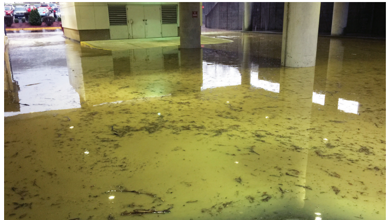
Flooding that struck the ambulance bay during the storms on April 3 rd .

St. Claire Regional is proud to announce that