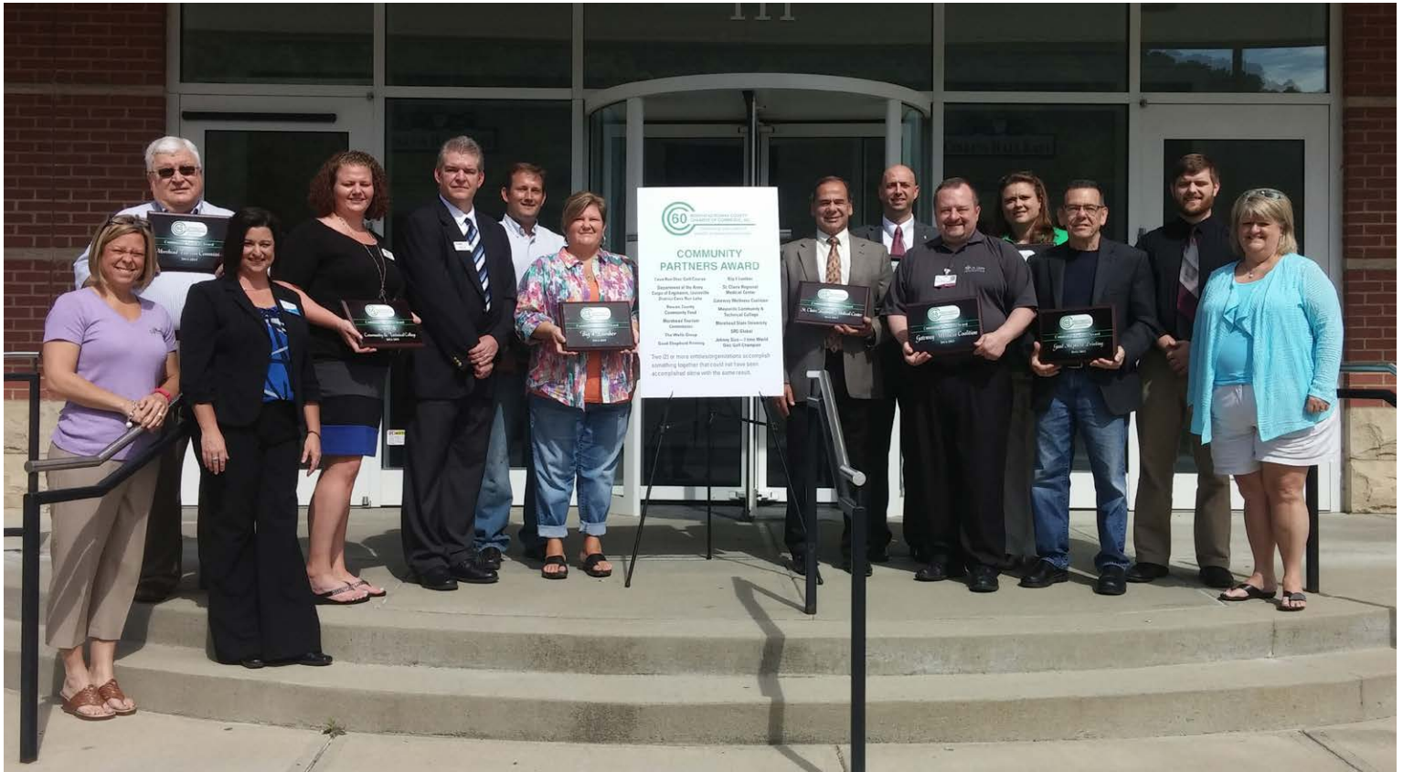
Representatives of the recipients of the Commerce Community Partners Award.

Reprinted from the Morehead News - July 17, 2015