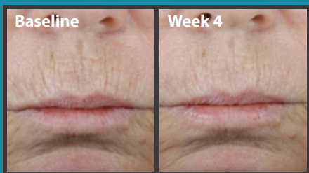
visible results within 4 weeks