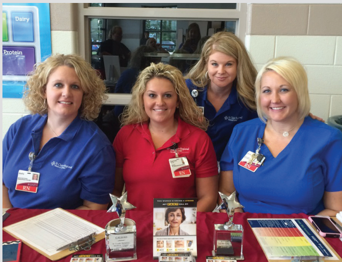
Members of SCR Stroke Program at the community health fair during Rowan County School's Ready Fest on August 7.