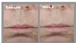
visible results within 4 weeks