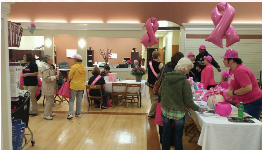
Nearly 100 women joined us Oct. 28 for our annual Go Pink event!