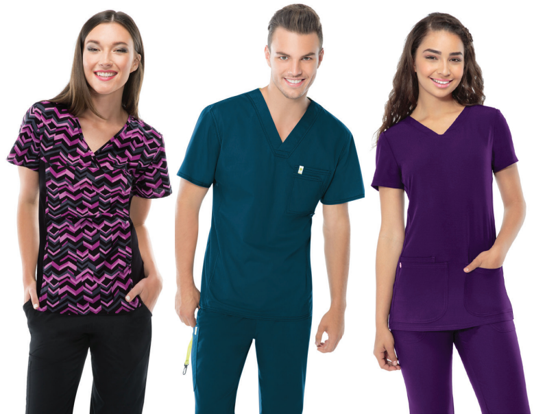
Koi • Landau • Cherokee

Sockwell Compression Socks Men's & Women's