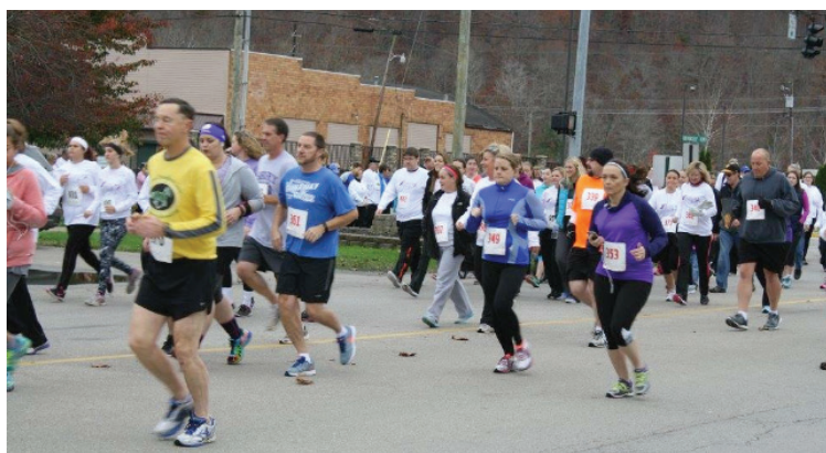
The Turkey Trot 5K kicked off at promptly at 10 a.m. with almost 230 runners.