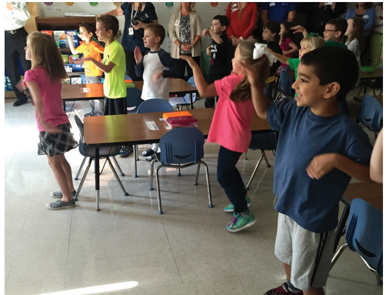
Students at McBrayer Elementary School doing “Pop See Koo,” one of the many activity breaks offered through GoNoodle. Visit our Facebook page to see the video from our launch event at www.facebook.com/SCRMedical .

GoNoodle PLUS is jam packed with even more programs that allow students to learn and be physically active at the same time. GoNoodle PLUS offers teachers and parents the possibility of customization, allowing the activities to coincide with the content being taught in the classroom. For example, Bodyspell, a PLUS-only activity, gives users the opportunity to insert their own