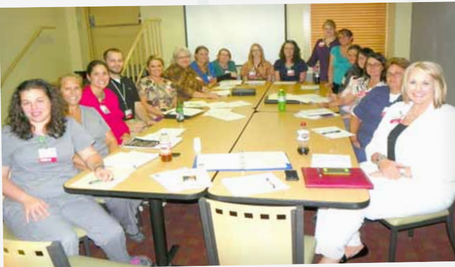
KNA Northeastern Chapter meeting on August 28