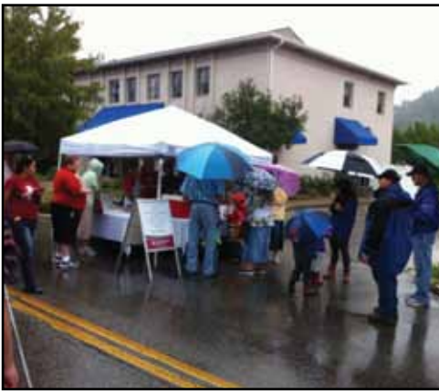
The crowd waits in the rain for Aramark's Maine lobster rolls and fresh squeezed lemonade at the Arts and Eats Festival.

Homeless Coalition and Rowan County Christmas. Each charity was given $3,024.50 in donations from the event. Congratulations and thank you Aramark for all you success at the Arts and Eats Festival.