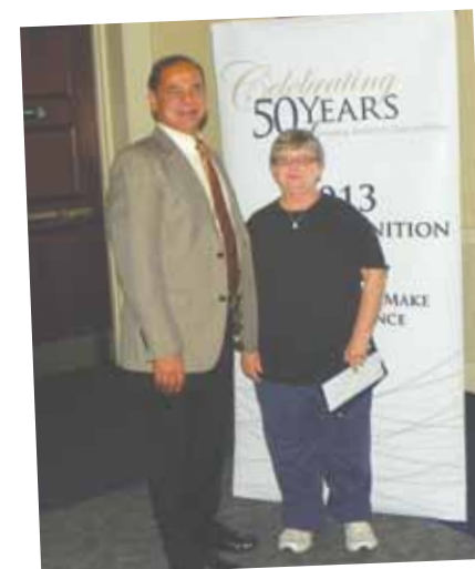
45 Years of Service