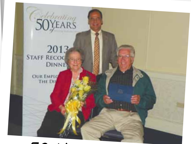
50 Years of Service