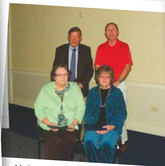
40 Years of Service