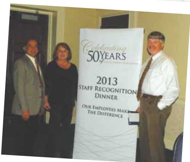
30 Years of Service