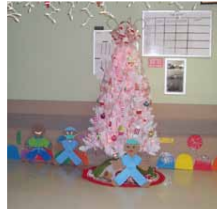
Third Place Surgery – “Taking a Stroll Down Candyland Lane”