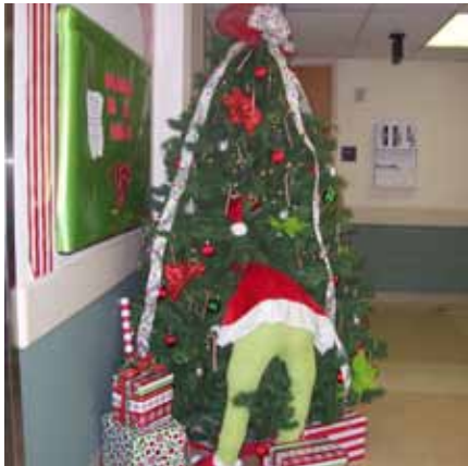
First Place 3rd Central – “Nursing is All Heart”