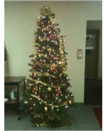
Third Place CRSS Physical Therapy – “Shades of Blue & Snowflakes”