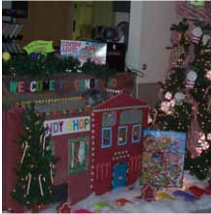
First Place Same Day Surgery – “Kingdom of Sweet Adventures”