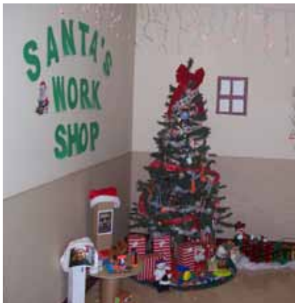
First Place Bio-Med – “Christmas Workshop”