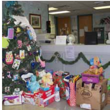
Second Place 5th Floor – “Hope for Christmas”