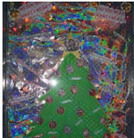
Second Place Patient Access – “Oh Dear!”