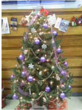
Second Place Owingsville Clinic – “Purple & Silver Tree”